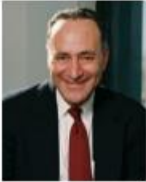
Democratic Leader Chairman of the Conference Schumer, Charles E. (D-NY)