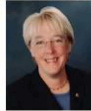
Assistant Democratic Leader Murray, Patty (D-WA)