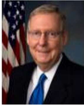
Republican Leader McConnell, Mitch (R-KY)