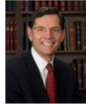
Republican Conference Chairman Barrasso, John (R-WY)