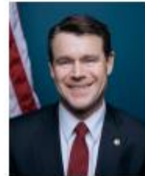
Republican Senatorial Committee Chairman Young, Todd (R-IN)