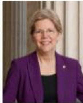
Vice Chair of Conference Warren, Elizabeth (D-MA)