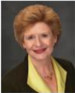
Chairwoman of Policy & Communications Committee Stabenow, Debbie (D-MI)