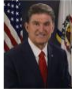
Vice Chairman of Policy & Communications Committee Manchin, Joe, III (D-WV)