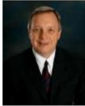
Whip Durbin, Richard J. (D-IL)