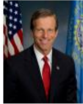
Assistant Republican Leader Thune, John (R-SD)