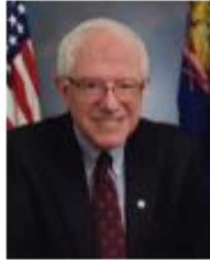
Chairman of Outreach Sanders, Bernard (I-VT)