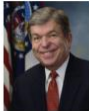
Republican Policy Committee Chairman Blunt, Roy (R-MO)