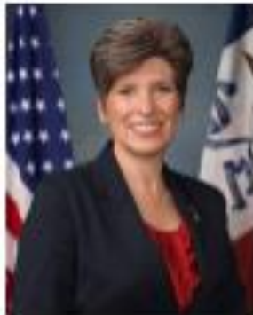
Vice Chairman of the Senate Republican Conference Ernst, Joni (R-IA)