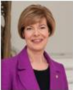
Secretary of the Conference Baldwin, Tammy (D-WI)