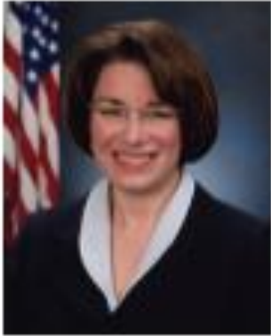
Chair of Steering Committee Klobuchar, Amy (D-MN)