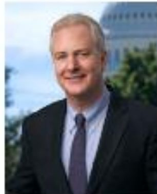
Chairman of Campaign Committee Van Hollen, Chris (D-MD)